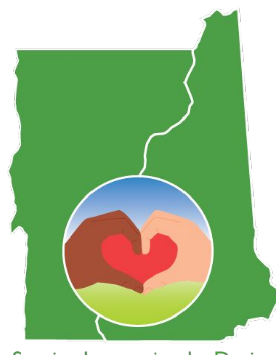
Service Integration by Design