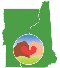
Service Integration by Design

The need: To evolve, regionalize, and sustain strategies that increase social connectedness in families with young children.