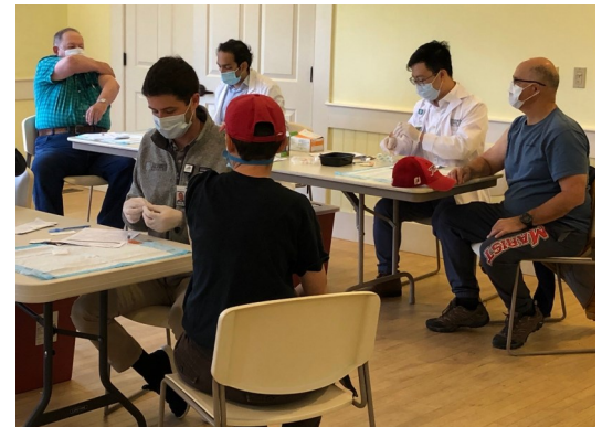
Back Inside: Orford Community Flu Vaccine Clinic, October 2022

Bradford, VT Corinth, VT Dorchester, NH Enfield, NH Grantham, NH Hanover, NH Hartford, VT Hartland, VT Lyme, VT Norwich, VT Orange, NH Orford, NH Piermont, NH Plainfield, NH Strafford, VT Thetford, VT Tunbridge, VT Washington, VT West Fairlee, VT Windsor, VT