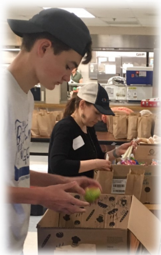
Making lunches at White River School

Throughout 2019, PHC partners set new strategies to address issues of greatest concern to our region: • Mental Health Care • Substance Misuse & Addiction • Availability of Primary Care Services • Support for Older Adults • Gender Based Violence • Strengthening Families By working together more effectively, educating ourselves and our communities, and advocating for our residents and the services they need, we make our region healthier, safer, more supportive and vital.